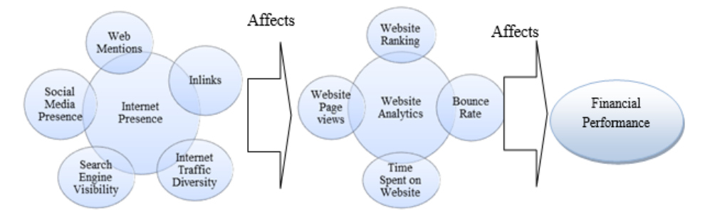
Figure 1: Conceptual framework: Internet presence, website analytics, and profitability